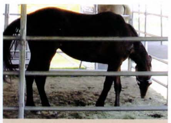
Horses enjoy relief and better health from high temperatures in Koolfog-equipped stalls.

Whatever your discipline there are numerous advantages an ideal environment will provide for your animals and your business. Animals that are comfortable will eat more and resist disease. Even better, milk production increases, mortality rates decline, eggs develop larger and birthing complications diminish.