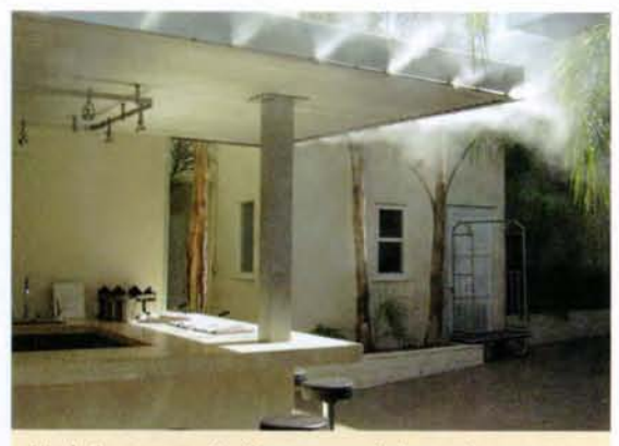
Hotels & resorts use Koolfog to create relaxing environments throughout their properties.

Our mission is to provide you with the tools that set you apart. Koolfog solutions are designed to help set a mood, enhance an experience or provide additional comfort. We provide a certain 'wow factor' that guests respond to.