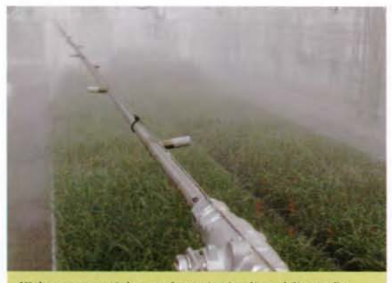
High-pressure stainless steel atomization lines deliver a fine mist which evaporates to provide cooling or humidification.

In today's competitive business environment you need an edge to compete more effectively. Koolfog technology provides that edge through efficient, well-designs systems that increase productivity and produce results. You owe it to your business and your plants to take a closer look at Koolfog.