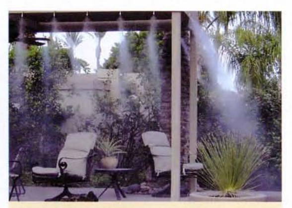
Complete your outdoor living experience with a Koolfog highpressure misting system.

Even more, Koolfog offers pure-water fog effects, or fogscapes<sup>™</sup>, that create dynamic and visually stunning elements to water features, landscapes and more. Add low-lying fog to a coy pond, integrate 'naturally occurring' mist into a waterfall, or form a backdrop to land-scape lighting. Koolfog is also used to cool pets and provide the ideal environmental control for plants and landscapes. The many uses and applications are only bound by your imagination.