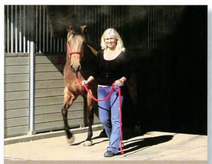
Stablecool can accommodate needs for individual stalls as well as large commercial equestrian facilities.

Stablecool solutions range from systems tailored to individual stalls to systems designed to accommodate large commercial equestrian facilities. Our integrated components for cooling make it easy for you to design and implement a system that will maximize the level of comfort for your horses.