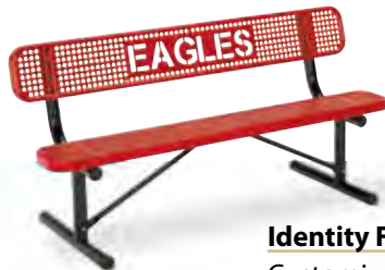
Identity Furnishings Customized furnishings to showcase your identity.