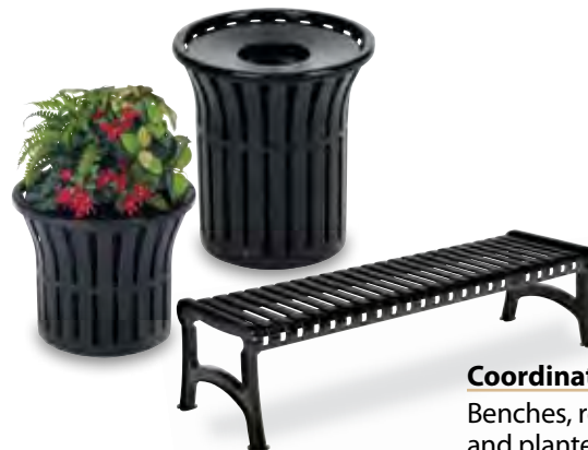
Coordinated Collections Benches, receptacles, tables and planters designed for a cohesive look.