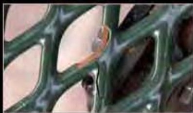
PEELING & RUSTING