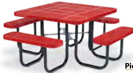
Picnic Tables Classic or modern tables to satisfy a variety of seating needs.