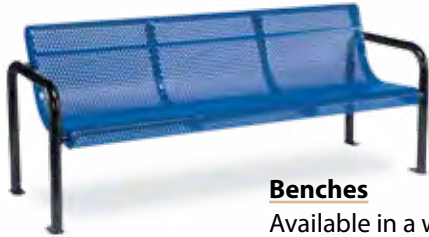
Benches Available in a wide range of styles, including traditional, park and sport seating.