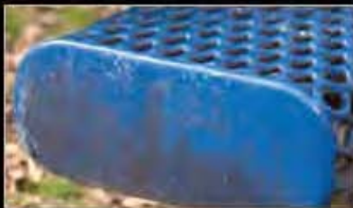
MOLD & MILDEW