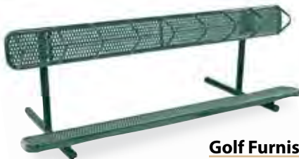
Golf Furnishings Durable and practical furnishings for the golf course.