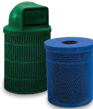
Receptacles Large selection of litter receptacles, ash/trash receptacles and ash urns for both indoor and outdoor use.