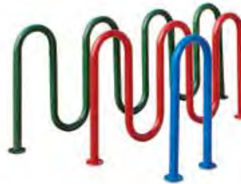
Bike Racks Space-saving bike racks in a variety of capacities and mounts.