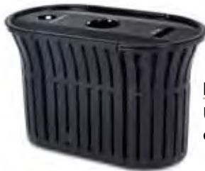
Recyclers Unique recyclers with classic or modern styling.