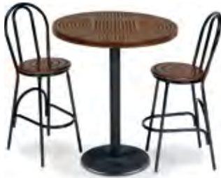
Tables & Chairs Dining comfort for the stylish patio or bistro setting.