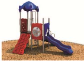
PLATINUM – PRIMARY