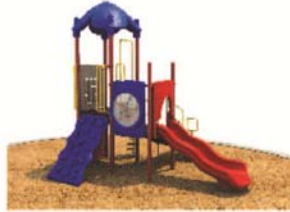
FIRECRACKER – PRIMARY