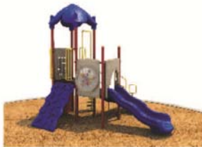
CASTLE – BLUE