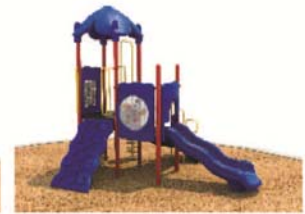
BLUE MOON- PRIMARY