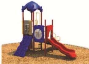
FIRECRACKER – PRIMARY