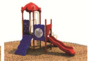
RED RIVER – PRIMARY