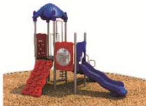
PLATINUM – PRIMARY