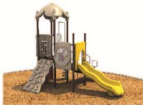
PIRATE SHIP – YELLOW