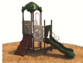
BACKWOODS - NATURAL